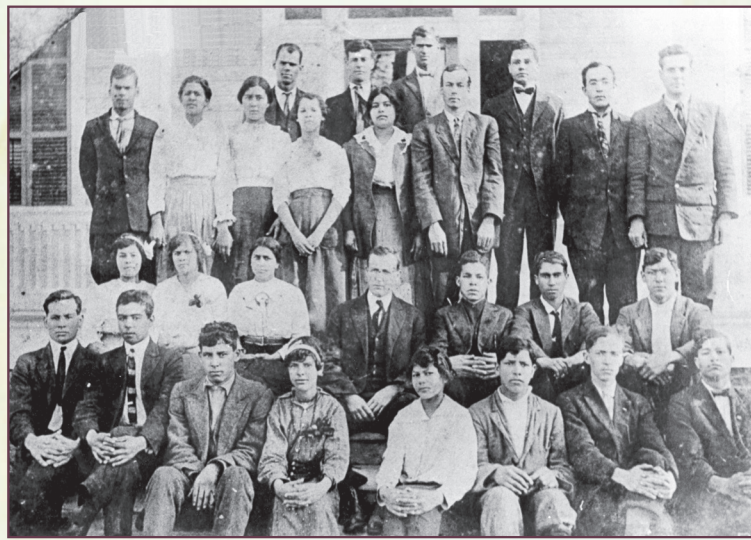
Indian Normal School Students with Principal ~ Circa 1916

with fervor, and achieved a remarkable success.