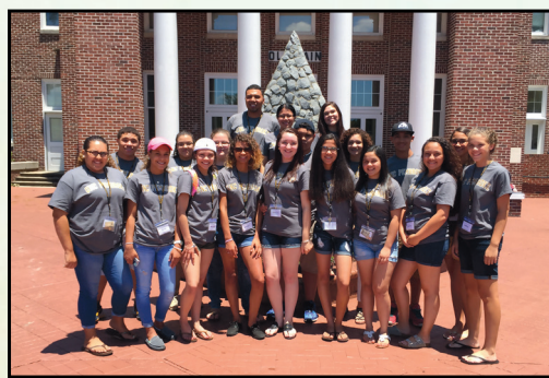
Left: Indian students attend a summer camp at UNCP through a grant program that builds upon the ongoing partnership between the Lumbee people and the University.

The school’s name changed along with the people up until 1941, when it began offering four-year degrees, and became known as Pembroke College for Indians. Between 1939 and 1953, it was the only state-supported four-year college for Indians in the entire nation. 5 Today, the school is part of the UNC campus system and is known as the University of North Carolina at Pembroke (UNCP). It recently celebrated its 125th