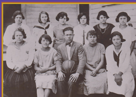
Prospect High School 1925 Basketball Team